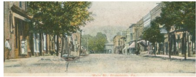
Main St., Blossburg, Pa.